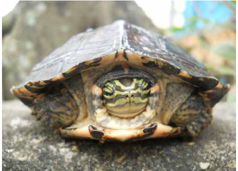
A juvenile M. annamensis in the wild – still a rarity.

In 2003, the year of the 'Shellshock Campaign', a discussion within the European