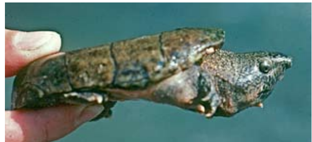
Figure 4. Old adult Sternotherus depressus from Gurley Creek, Alabama, with very flat shell.

Description. — Sternotherus depressus is a small, dark, mostly brown, turtle—adults measure approximately 65–120 mm in carapace length (CL), depending on sex, with males attaining maturity on average at a slightly smaller size than females (Close 1982). Hatchlings measure 31–33 mm