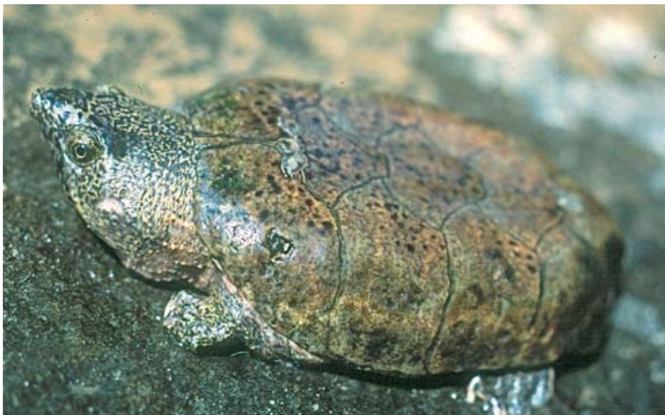
Figure 1. Old adult Sternotherus depressus from Gurley Creek, Alabama.

of the Warrior system (e.g., North River and Blue Creek, Tuscaloosa and Fayette counties) and at least one eastern tributary of the Sipsey River (Boxes Creek) of the Tombigbee River drainage appear to be intermediate between S. depressus and S. minor based on shell shape and head and neck patterns. Ernst et al. (1989) generally referred intermediate populations to S. depressus , although they did not discuss the Boxes Creek turtles. Iverson (1977a, b) suggested that