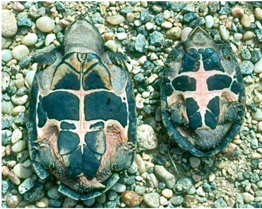
Figure 2. Adult Sternotherus depressus from Lost Creek, Alabama. Left: female. Right: male.

hybridization resulted from secondary contact after the construction of impoundments at the Fall Line eliminated natural geographic barriers to dispersal.