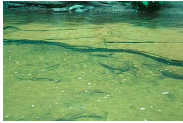
Figure 8. Sipsy Fork, Alabama. Ideal Sternotherus depressus habitat, showing sandstone crevice.

Males reach sexual maturity at 4–6 yrs and females reach maturity at 6–8 yrs (Close 1982). Females reach maximum size at 30–40 yrs, and males at 50–60 yrs (Holmes 2005). Females produce an average of two clutches of 1–3 eggs annually which are deposited on sandy slopes adjacent to the stream. The eggs are approximately 32 mm x 16 mm, and weigh 5.5 g. Nesting occurs generally from May through late July, with hatching through at least mid-September. Population structure and size, biomass, and sex ratios may or may not vary among drainages (Dodd et al. 1988; Dodd 1989; Bailey and Guyer 1998; Holmes 2005). Males generally outnumber females, although there was a decline in the ratio of males to females from the 1980s to the 2000s (Bailey and Guyer 1998; Holmes 2005). Flattened musk turtles are parasitized by leeches in inverse proportion to the degree of habitat degradation (Dodd 1988a).