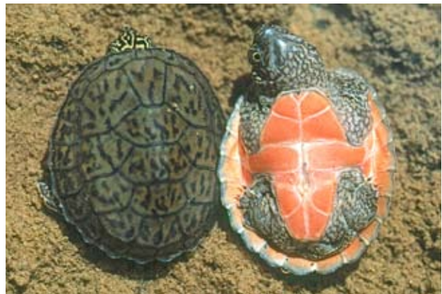
Figure 5. Hatchling Sternotherus depressus from Alabama.