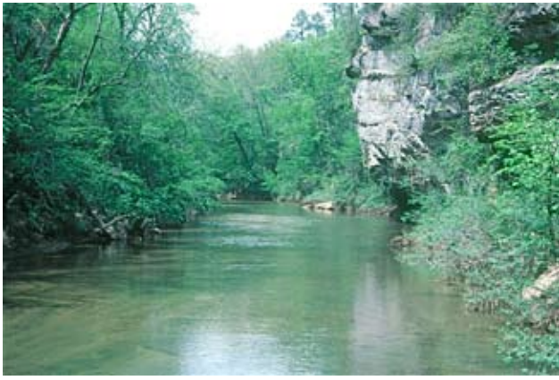
Figure 7. Sipsy Fork, Alabama. Location of the largest extant population of Sternotherus depressus .

mud along stream margins. Juveniles are found in shallow weed beds and riffles. Ideal habitat includes a water depth of approximately 0.5 m, vegetated shallows alternating with deeper pools, pools containing detectable current, an abundance of crevices, low silt loads and minimal silt deposits, abundant molluscan fauna, a relatively low nutrient content and bacterial count, moderate temperatures, and minimal pollution (Mount 1981; Johnson 1986; Dodd et al. 1988).