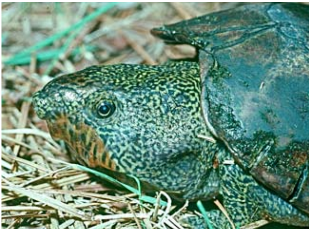
Figure 4. Old adult Sternotherus depressus from Sipsey Fork, Alabama.